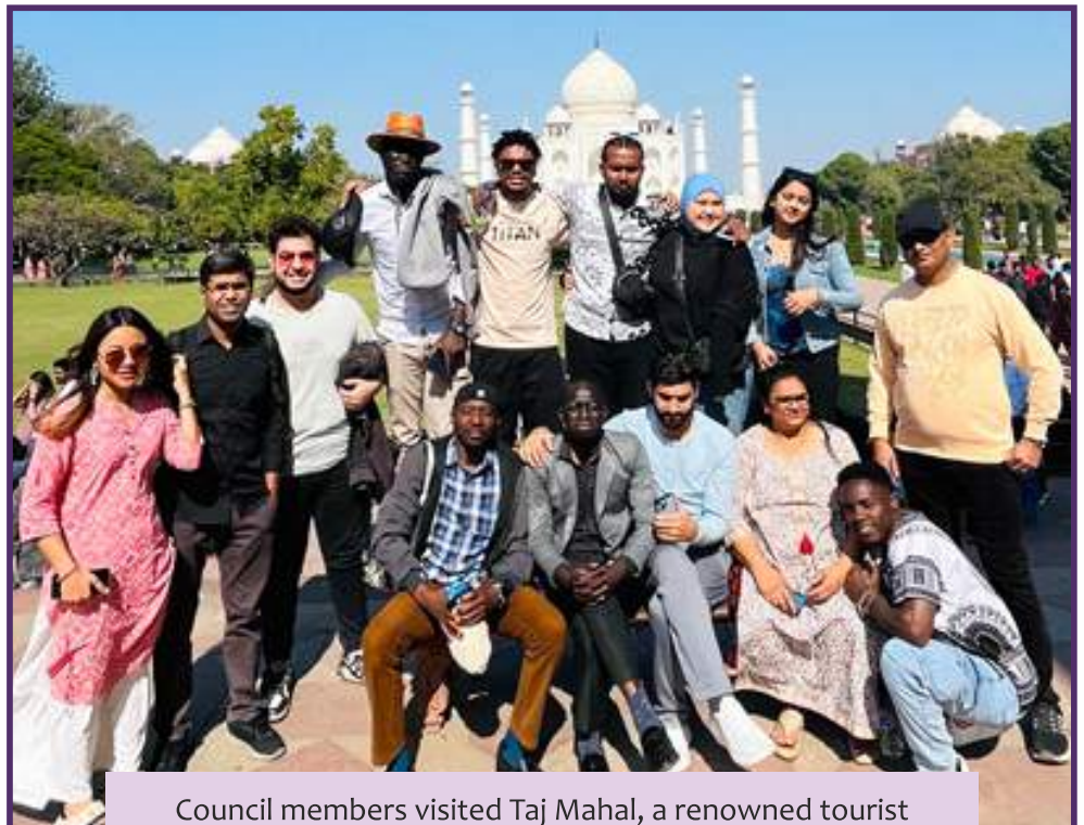
Council members visited Taj Mahal, a renowned tourist attraction in Agra, which is a UNESCO World Heritage site