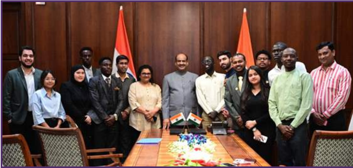
Meeting with the Hon'ble Speaker of the Lok Sabha, Shri Om Birla