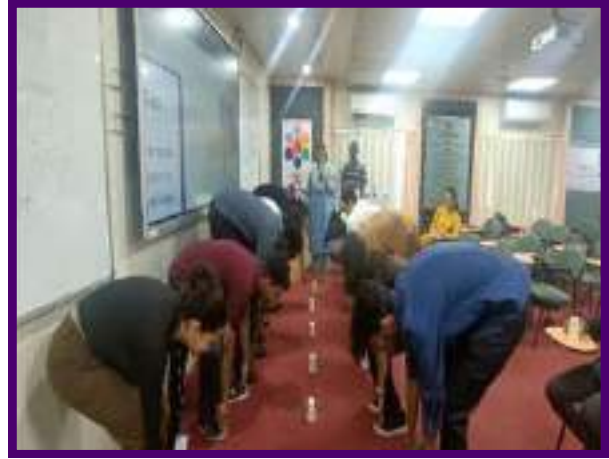
Student Relations team conducted a meet for first year foreign national students of Symbiosis along with their buddies at Vimannagar, S. B. Road and Lavale.