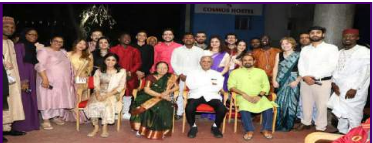
Symbiosis International (Deemed University) hosted a vibrant Diwali celebration for over 450 international students, bringing together diverse cultures in a festive evening of joy and companionship. Students enjoyed the thrill of sparklers and crackers, immersing themselves in the festival's lively spirit. The students were gifted a special Diwali faral packet filled with classic festive treats like laddoos, chiwada, shankarpale and chakli, offering a sweet taste of the holiday.